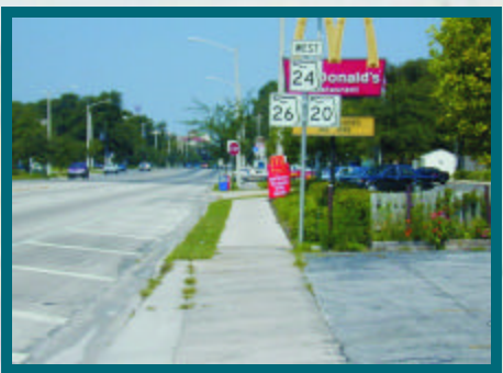
East University Avenue facing toward downtown Gainesville