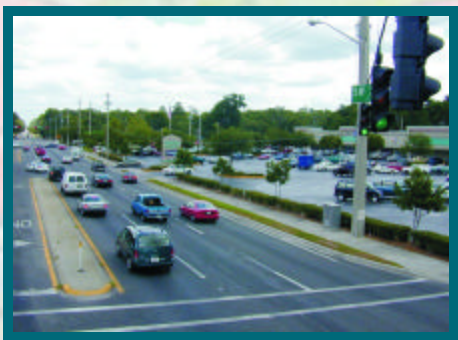
West 34th Street facing north at Westgate Plaza