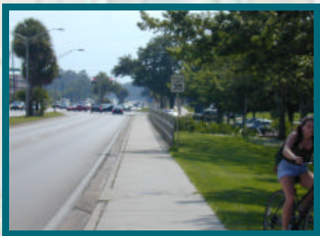
Archer Road facing west adjacent to Shands Hospital

2020 Transportation Plan Metropolitan Transportation Planning Organization for the Gainesville Urbanized Area