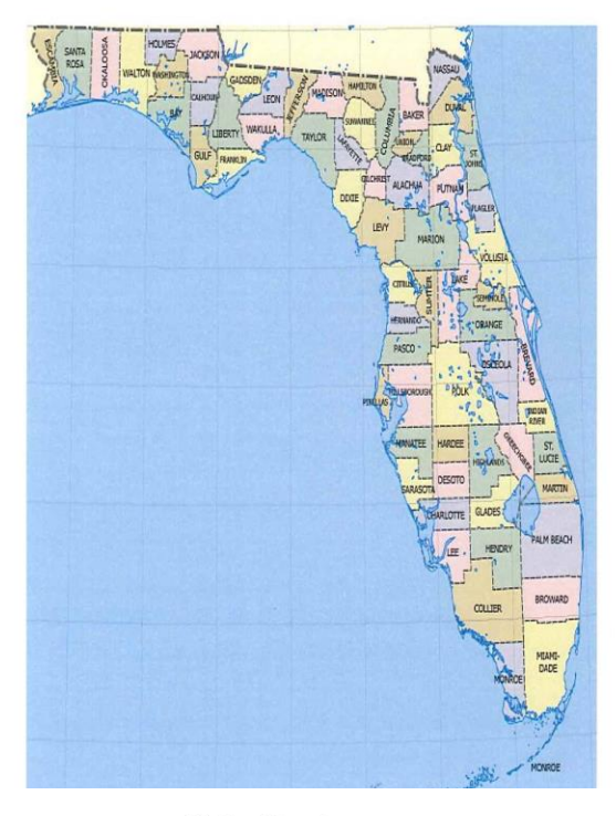
Union County Programs and Services