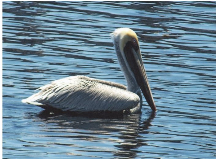
Coastal resources in the north central Florida region, such as the Big Bend Salt Marsh and Big Bend Sea Grass Beds, are recognized as Natural Resources of Regional Significance in the North Central Florida Strategic Regional Policy Plan.