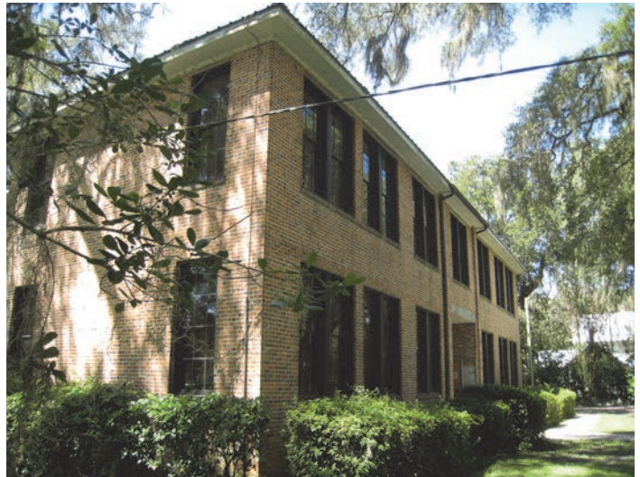
The Council provided assistance to the Town of Micanopy and other local governments throughout the north central Florida region with comprehensive planning and land development regulation.

In particular, the Council assisted seven counties and 13 municipalities process 94 development-related applications. This assistance included the review and adoption of 32 comprehensive plan map and text amendments. The Council also assisted these local governments with 46 land development regulation map and text amendments, eight land development regulation special exceptions, six variances and two site and development plans.