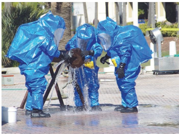
Firefighters from the north central Florida region attend the Florida Hazardous Materials Symposium and receive both classroom and hands-on training.

The Committee plans and conducts field exercises and tabletop exercises concerning response to hazardous materials incidents in the north central Florida region. The exercises provide an opportunity for first responders to meet and determine how to work together to respond to such incidents using available resources.