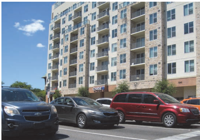
The Metropolitan Transportation Planning Organization for the Gainesville Urbanized Area adopted the 2020-21 to 2024-25 Transportation Improvement Program for highway, transit, bicycle and pedestrian projects in the Gainesville Metropolitan Area.

In 2020, the Metropolitan Transportation Planning Organization for the Gainesville Urbanized Area approved federally-required transportation performance measures and targets for: