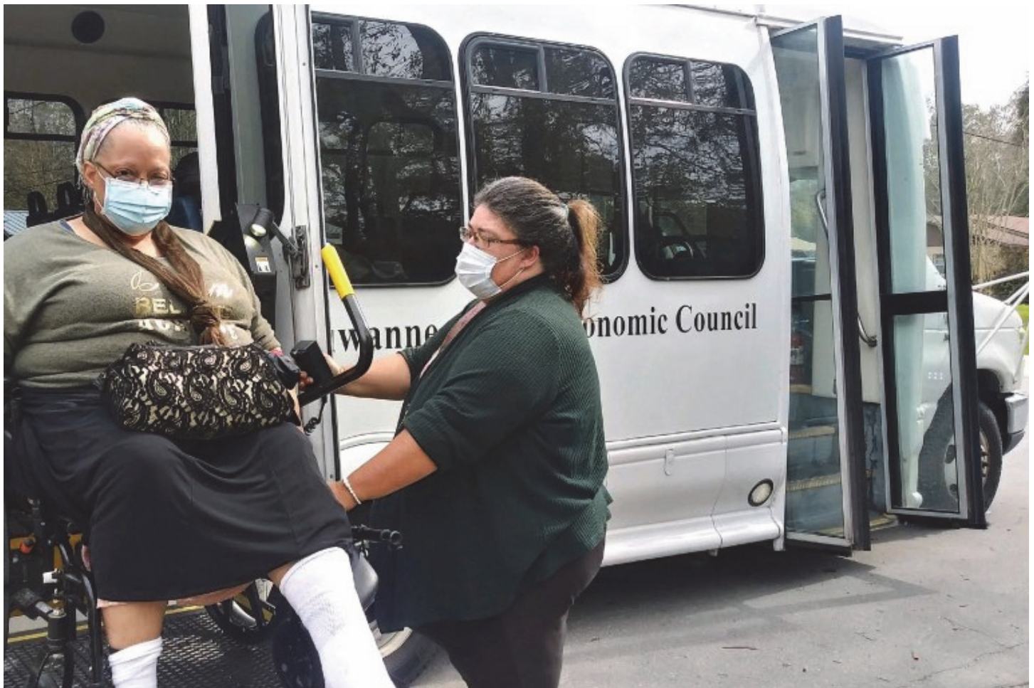
Suwannee River Economic Council, Inc., the Community Transportation Coordinator for Bradford, Dixie, Gilchrist, Lafayette and Union Counties, provided public transportation services to persons who were unable to transport themselves because of age, disability or income status.

"The Council provided staff support to transportation disadvantaged local coordinating boards to coordinate trips for access to employment, health care, education and other life-sustaining activities for residents of the region."